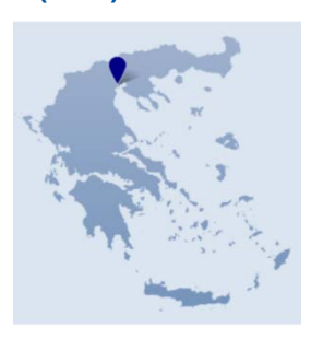
Figure 1: SKG Airport

Thessaloniki International Airport "Makedonia" is located in the municipality of Thermi and is around 16km south east of the city of Thessaloniki, the second largest city in Greece. The airport is the third largest in Greece by the number of passengers and the second largest in terms of air traffic movements The airport incorporates both civilian and Military use.