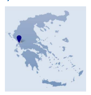
Figure 5 PVK Airport

Aktion International Airport is located on a peninsula between Preveza (4km), Vonitsa (16km) and Lefkada Island (20km). The airport, including both civil and military areas, covers 2,665,159m<sup>2</sup>.