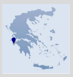
Figure 4 ZTH Airport

Zakynthos International Airport "Dionysios Solomos" is located in the south east of the Island of Zakynthos, which is in the western Ionian Sea near the town of Kalamaki. The airport is around 4 km from the capital of the island, the town of Zakynthos.