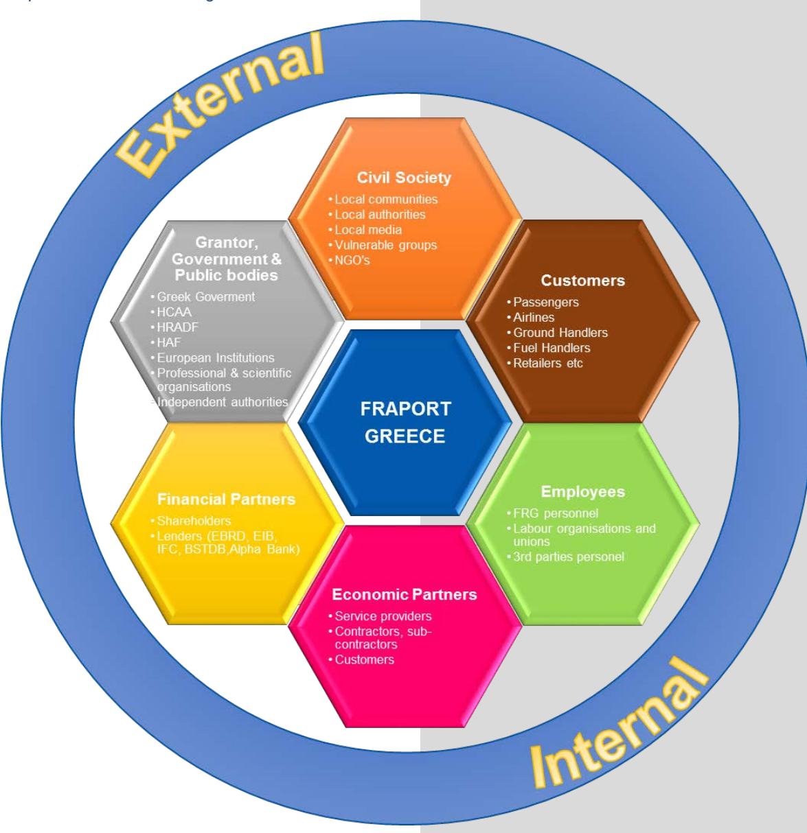
Graphic 1: Stakeholder categories