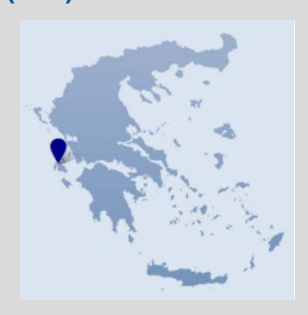
Figure 3: EFL Airport

Kefalonia International Airport "Anna Pollatou" is located near Svoronata village, about 8 kilometres south of Argostoli, the capital of Kefalonia.