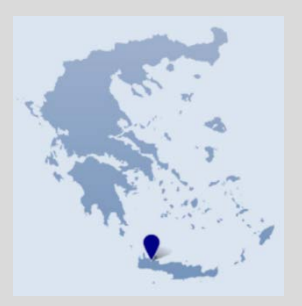
Figure 7 CHQ Airport

Chania International Airport "Ioannis Daskalogiannis" is located in the Akrotiri peninsula in the north-west of the Island of Crete, the largest of the Greek islands. The airport is around 15 km from the town of Chania and 100 km from the capital of the island, Heraklion. The airport includes both civilian and military areas. Near the airport of Chania there are no protected areas of environmental significance.