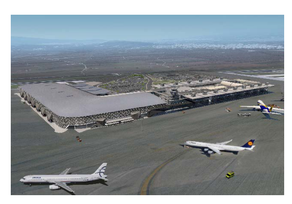
Figure 8: Future SKG Airport view