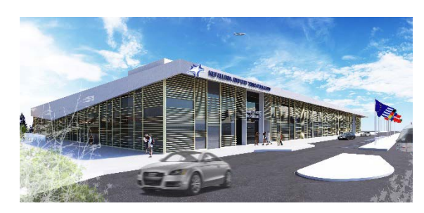
Figure 10 Future EFL Airport view