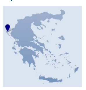
Figure 2: CFU Airport

Kerkyra International Airport "Ioannis Kapodistrias" is an Ionian island airport located in Kerkyra, three kilometres south of Kerkyra town, in the coastal sea area between Kanoni and Mesoggi villages. The island of Kerkyra is one of the most popular tourist destinations in Europe, attracting visitors from the UK, Scandinavia, Germany, Italy and Austria.