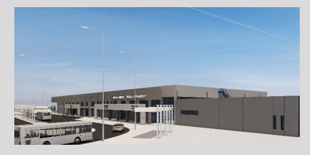
Figure 13 Future KVA Airport view